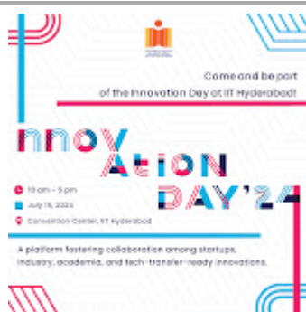
INVITATION (2).jpg 489K

Disclaimer:- This footer text is to convey that this email is sent by one of the users of IITH. So, do not mark it as SPAM.